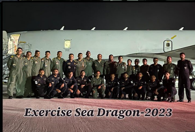
Exercise Sea Dragon-2023