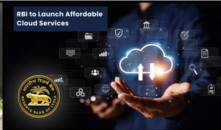
RBI to Launch Affordable Cloud Services