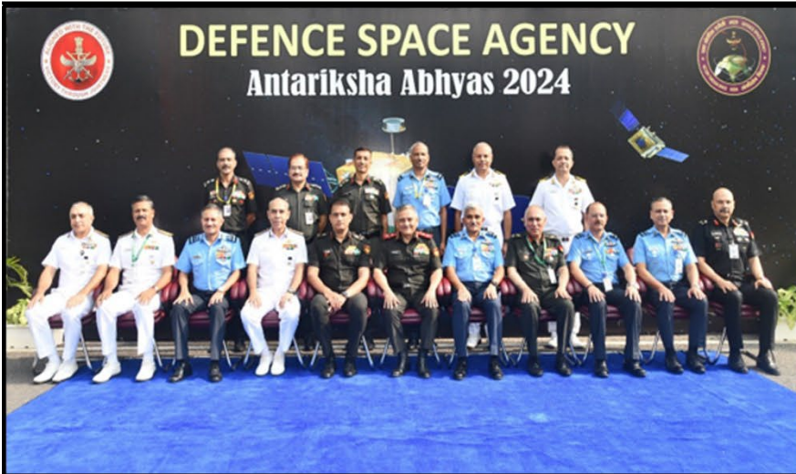
DEFENCE SPACE AGENCY Antariksha Abhyas 2024